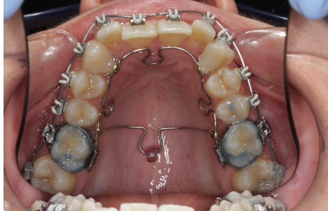
ALF with Delta Force Brackets. TPA and tongue training ball for active tongue thrust therapy.