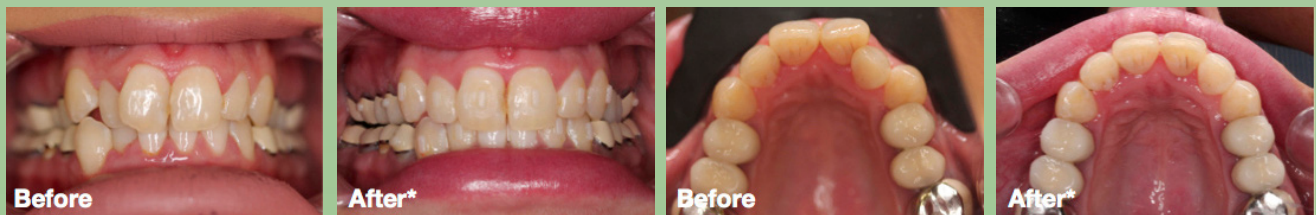
*SmileTRU Level 2 U & L (10 Aligners - 20 weeks, Dr Lloyd Saville, 818 Dental)

At SmileTRU we know there are other clear aligner choices on the market...that is why we decided to create a product that is not just another choice, but an entire program. SmileTRU allows the practitioner to work with the patient regardless of the extent of their misalignment. It is categorised into 4 levels: Level 1 - Canine-to-Canine, Level 2 - Premolar-to-Premolar, Level 3 - Full-mouth and Level 4 - Full-mouth in conjunction with orthopaedic appliances.