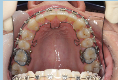
Development achieved 6 months active treatment. TPA removed and tongue thrust under control.